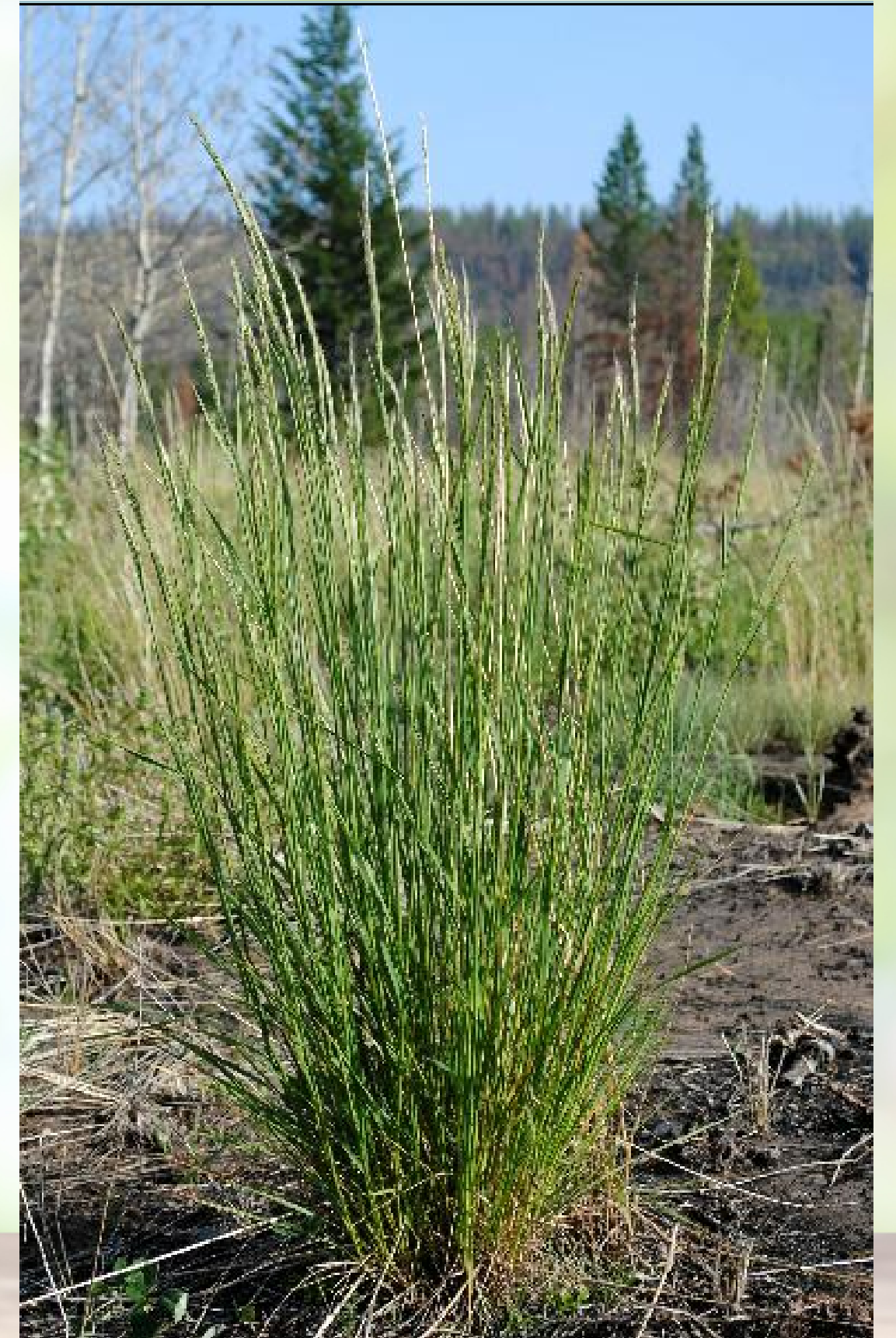
Percy Folkard 2013